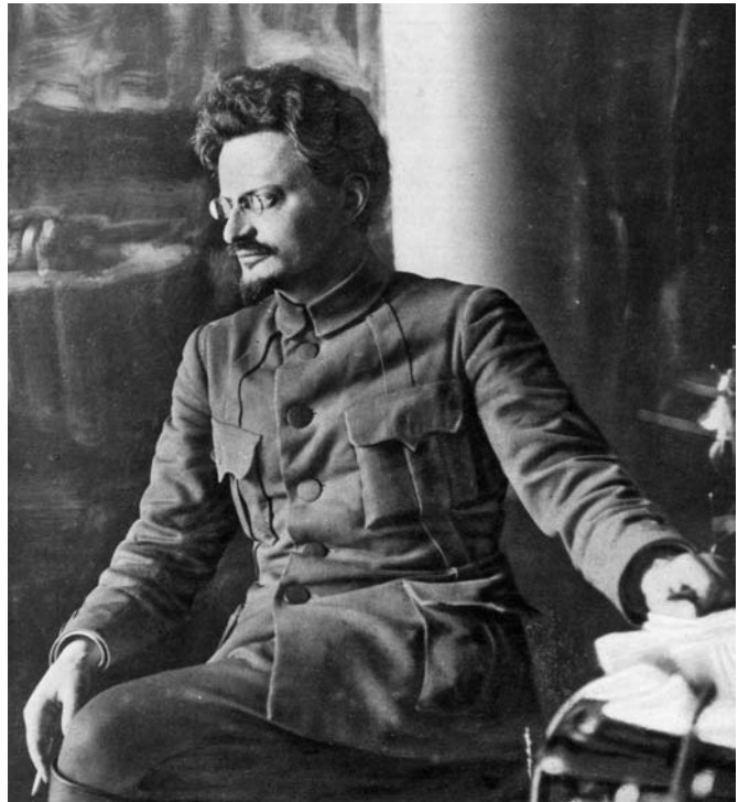
Trotsky, the gifted commander of the Red Army, the eventual victors in the civil wars that secured Bolshevik power

T RADITIONALLY, HISTORIES OF THE RUSSIAN CIVIL WAR have concentrated on the struggle between the Bolsheviks' Red Army, led by Trotsky, and the various White Armies, led by Admiral Kolchak in the east, General Denikin in the south and General Yudenich in the west. What has become clear, as historians have accessed new documentation made available after the collapse of the Soviet Union in 1991, is that this picture needs to be drastically revised. The Red-White Civil War was only part of the story. In fact, there was not one civil war in Russia, but two civil wars. This was very clear to those at the time. Britain's most successful secret agent in Russia during 1919 was Paul Dukes, code named ST25. He noted: