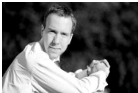
Matthew Hancock MP, is responsible for Apprenticeships and Traineeships

Traineeships will give tailored work preparation training to ensure young people develop the abilities and confidence needed to take the first step in their career, such as an Apprenticeship. Additional maths and English support will increase employability and earning potential.